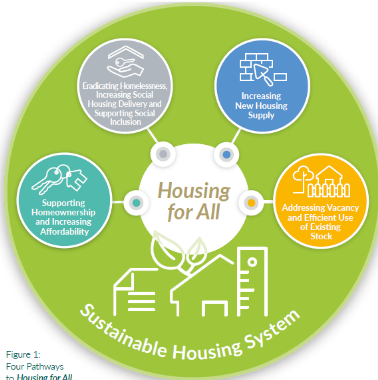
Figure 1: Four Pathways to Housing for All

Supporting the Four Pathways and enabling a Sustainable Housing System – longer term focus on sustainability, including tackling costs through a better construction industry, reforming regulation, improving governance and supporting infrastructure.