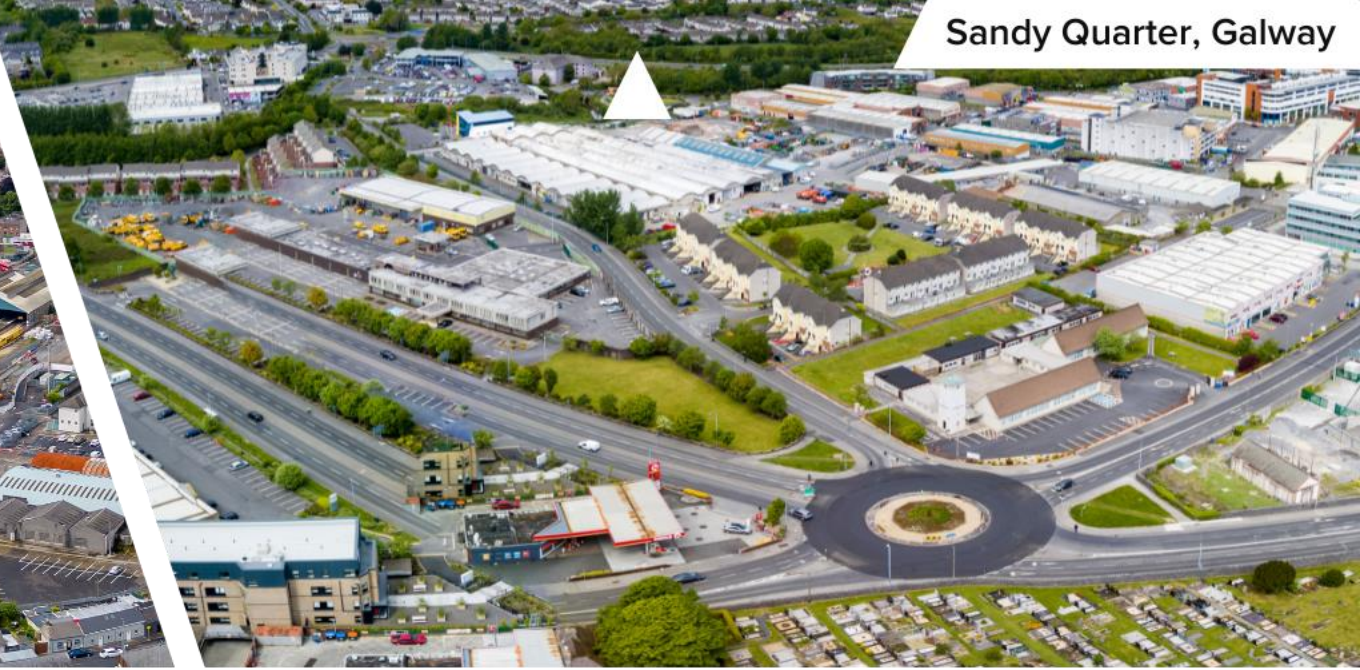
Sandy Quarter, Galway