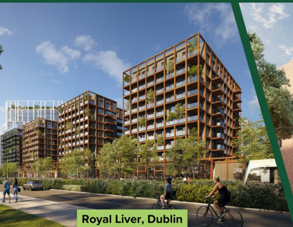
Royal Liver, Dublin

Identifying land opportunities using the criteria from the LDA Private Land Acquisition Initiative.