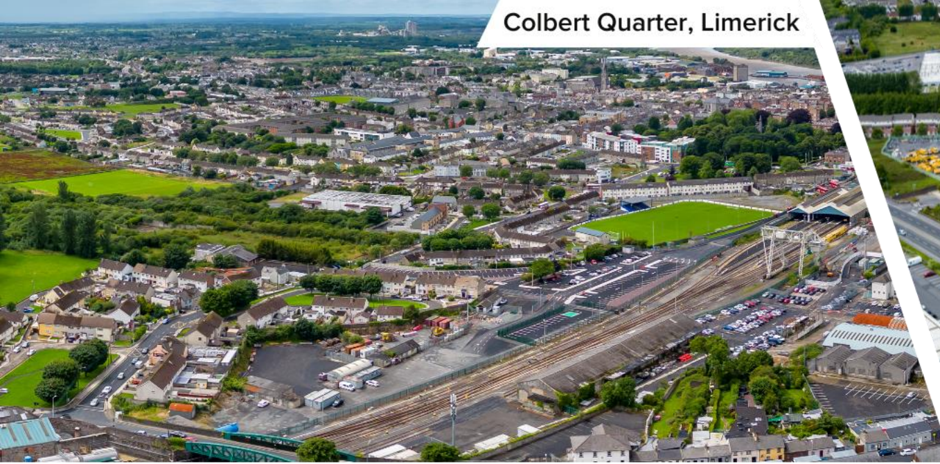
Colbert Quarter, Limerick